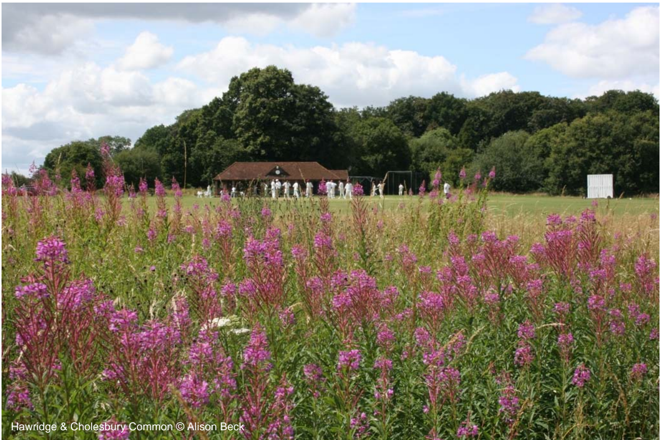
Hawridge & Cholesbury Common